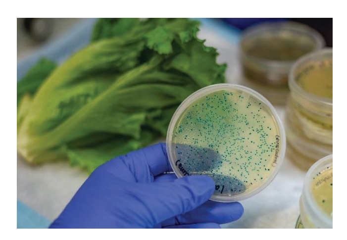
Food Safety Specialists

They ensure that a food product is safe to eat and that all company standards and government rules have been followed.